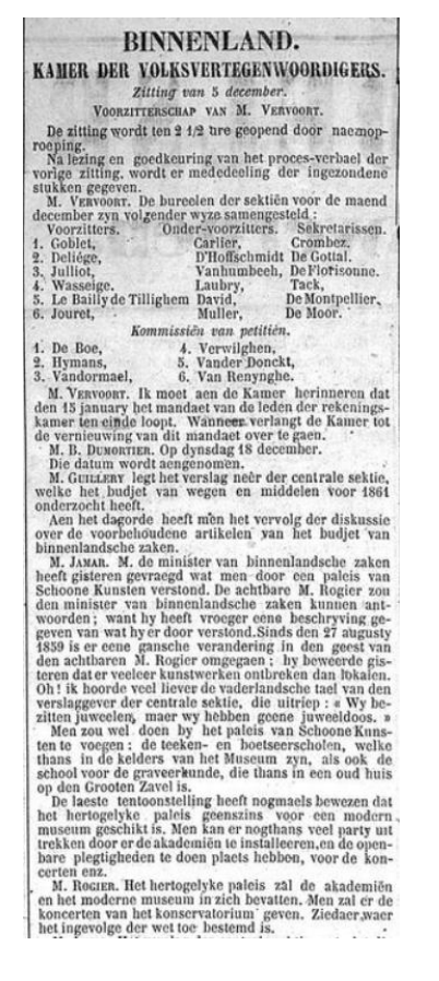
Image 3. Fragment of a report of a discussion held in the Chamber of Representatives, published in Flemish newspaper Het Handelsblad on 6 December 1860.

of the discussions held in Parliament, rather than with the form and procedures of translation. In the case of semi-official translations, however, their "metatextual status" as translation, or the fact that the text was derived from another text (Dullion, 2007, p. 71), was often underscored, including indications in their title or on the title page that they were translated from French, or that they concerned an edition including the French official text with its Flemish translation.