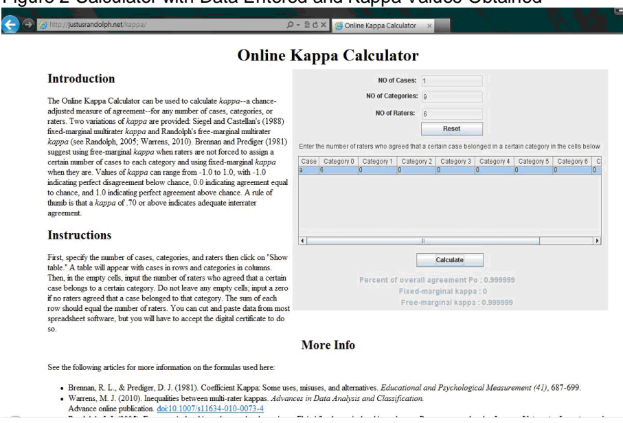
Figure 2 Calculator with Data Entered and Kappa Values Obtained

The above is an example of applying the kappa coefficient to this research. After counting the values of all other cases, Table 3 is produced.