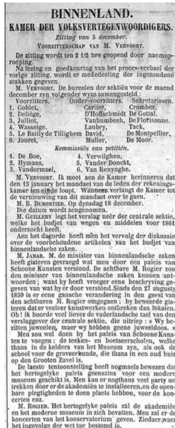
Image 3. Fragment of a report of a discussion held in the Chamber of Representatives, published in Flemish newspaper Het Handelsblad on 6 December 1860.

of the discussions held in Parliament, rather than with the form and procedures of translation. In the case of semi-official translations, however, their “metatextual status” as translation, or the fact that the text was derived from another text (Dullion, 2007, p. 71), was often underscored, including indications in their title or on the title page that they were translated from French, or that they concerned an edition including the French official text with its Flemish translation.